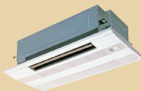
PMFY-E Ceiling-concealed ducted