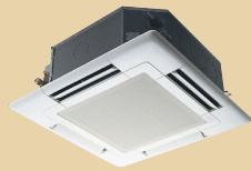
PLFY-E Ceiling-recessed cassettes